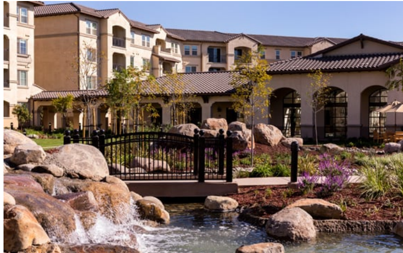
The Glen at Scripps Ranch

In addition to learning a lot of useful information, we appreciated Sue Moxon's attitude: "Live is Short" "Use the Good Soap."